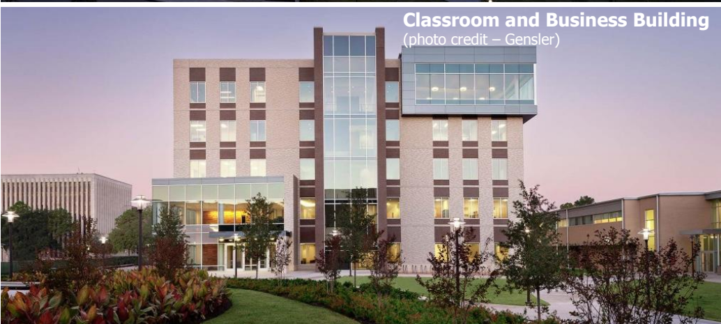
Classroom and Business Building (photo credit – Gensler)