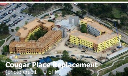
Cougar Place Replacement