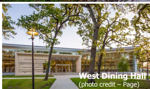
West Dining Hall

Building Exterior Solutions A Terracon Company 6975 Portwest Drive, Suite 100 Houston, Texas 77024 713.467.9840